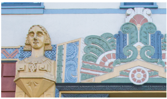
Veritas Investments, 915 Pierce Street apartments